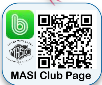
MASI Club Page