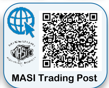
MASI Trading Post